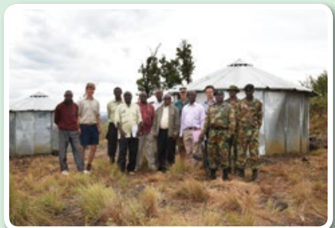
Committee inspects Naitolia Joint Patrol Camp

The Committee is further supporting a technical review of the existing private Loldia Farm fences along the wildlife corridor to Lake Naivasha. This process is geared towards ensuring that the fences meet necessary game-proof standards, and thus ultimately securing the wildlife corridor.