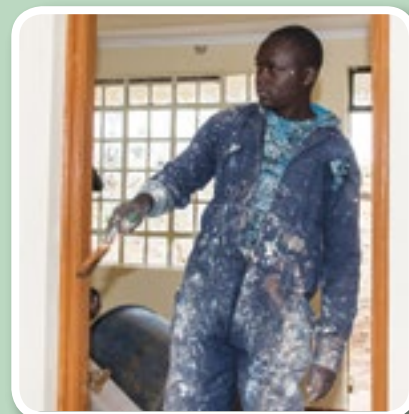
An artisan carries out painting work