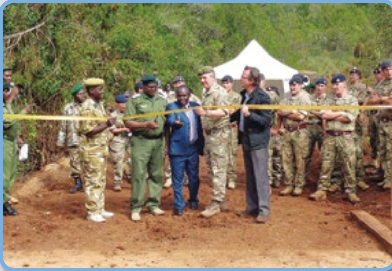
Commissioning of Sirimon Bridge - Cutting of the ribbon by BATUK Commandant