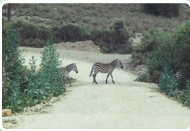
Wildlife movement in Ndabibi area