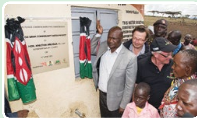
Nakuru County Deputy Governor unveils the commissioning plaque