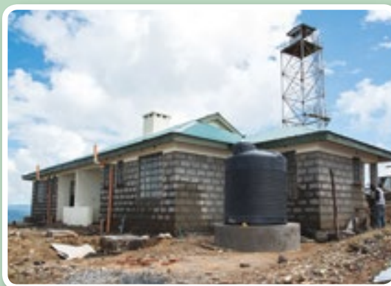
View of the Fire Watch Tower fence energizer house

Construction of the third fence energizer house is making steady progress, and is now over 85% complete. The facility will house two fence scouts, tools, fence maintenance materials and the power system for a 20km section of fence. The energizer house is located near the Fire Watch Tower on Ngobobo Hill near Eburru settlement. It offers a commanding view of the surrounding terrain and fence line, and will provide a base for two fence scouts who maintain an 8km section of the fence on a daily basis.