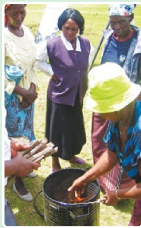
Training session at Eburru