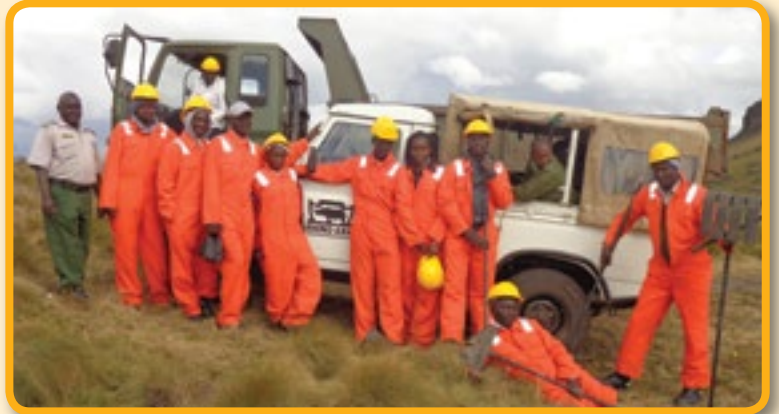
AJSU in the Northern Aberdares assist in fighting wild fires in early February

The Aberdare Joint Surveillance Unit (AJSU) joined the Kenya Wildlife Service, Kenya Forest Service and members from the forest-adjacent communities to extinguish one of the largest wild fires of the season in the moorlands of the Northern Aberdares in early February 2015. Wild fires most often occur during the dry season of January to March.