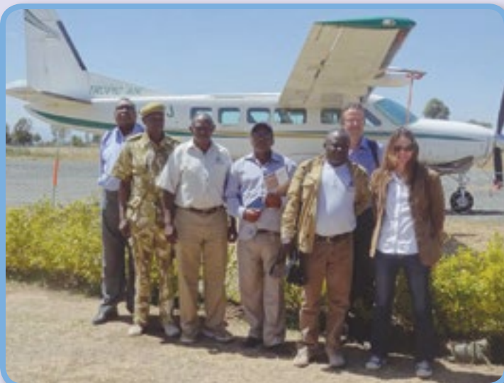
Aerial surveillance team on 14th January 2015

Rhino Ark, together with KFS, KWS and Mount Kenya Trust, flew above sections of the forest of Mt. Kenya located in Tharaka Nithi and Meru counties on 14th January 2015. The purpose of the flight was to monitor illegal activities in Chuka forest and the illegal cultivation of marijuana in the upper forest / bamboo belt in both counties. The surveillance team comprised of: KWS Senior Warden, Mt. Kenya National Park/Reserve; KWS Company Commander; KFS Ecosystem Conservator, Tharaka Nithi County; KFS Regional Commander, Eastern Conservancy; KFS Senior Forester; CEO, Mount Kenya Trust; Executive Director, Rhino Ark; Fence/Community Manager, Rhino Ark.