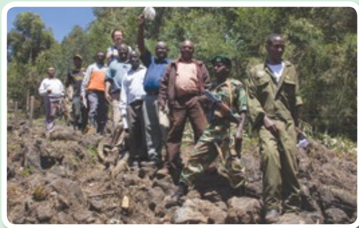
Project team members during inspection of final section of the fence along Loldia Farm boundary