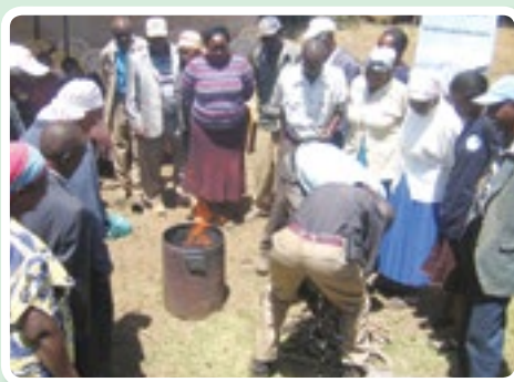
Training at Ndabibi

125 community members received training on the use of domestic charcoal making jikos, and 6 jikos were procured and embedded with the community for ongoing peer training. The jikos make it possible for households to produce their own charcoal using feedstock available on farms, such as tree branch prunings and dried maize cobs - at no additional cost. Since the purchase of local charcoal is expensive (up to KES 1,000 per 90kg bag), the jikos offer a means to reduce both domestic energy expenditure and the need to extract the resources from the forest. The training has been made possible with funding support from the MPESA Foundation.