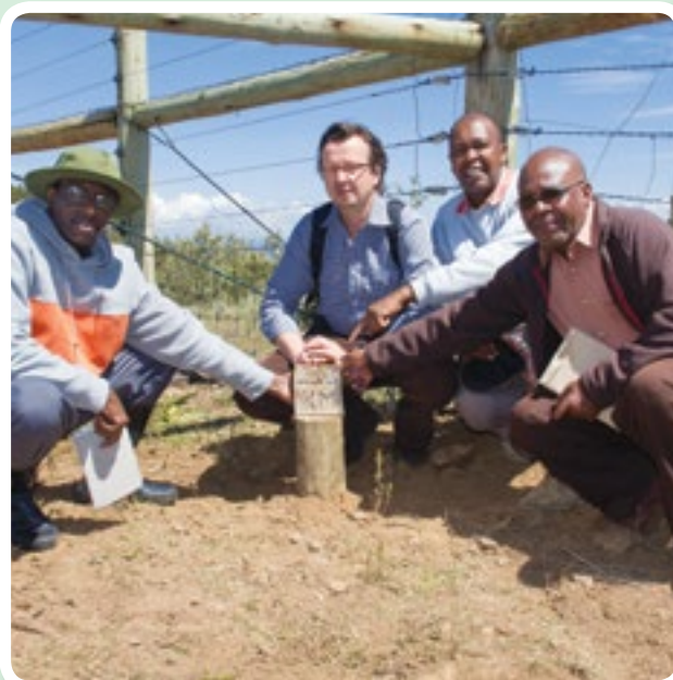
Project team members inspect the 43.3 km the distance marker at the fence completion point near the Fire Watch Tower

The focus is now on the completion of fence associated infrastructure, including the third fence energizer house at the Fire Watch Tower near Eburu Forest Station and the building of metallic lockable gates at each fence access point.