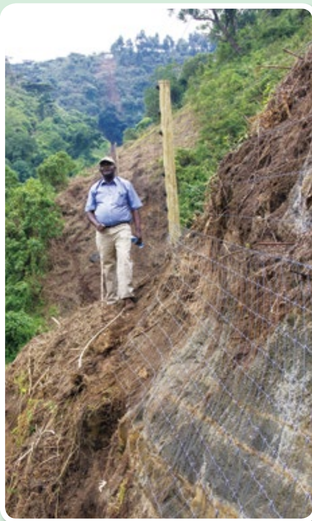
Steep section of the fence