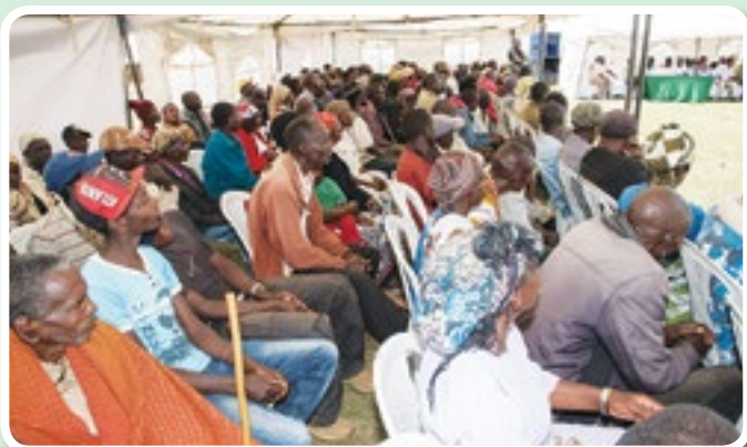
Attentive local community members follow the event proceedings

Through this partnership, funding and technical expertise has been harnessed to provide solutions to the water challenges facing the Ole Sirwa community. A master plan for community water infrastructure was developed, and specific components of this plan were implemented by the partners within the period 2014-2015, including protection of the spring points, construction of water tanks and water distribution kiosks, and a condition survey of the water pipelines from the forest to community areas. These activities have improved the water flow and water quality for the community. Laboratory tests conducted before and after the springs protection works indicate a substantial decrease in water contamination from high health risk to low risk. Rhino Ark's contribution to the initiative has been achieved with funding support from the MPESA Foundation.