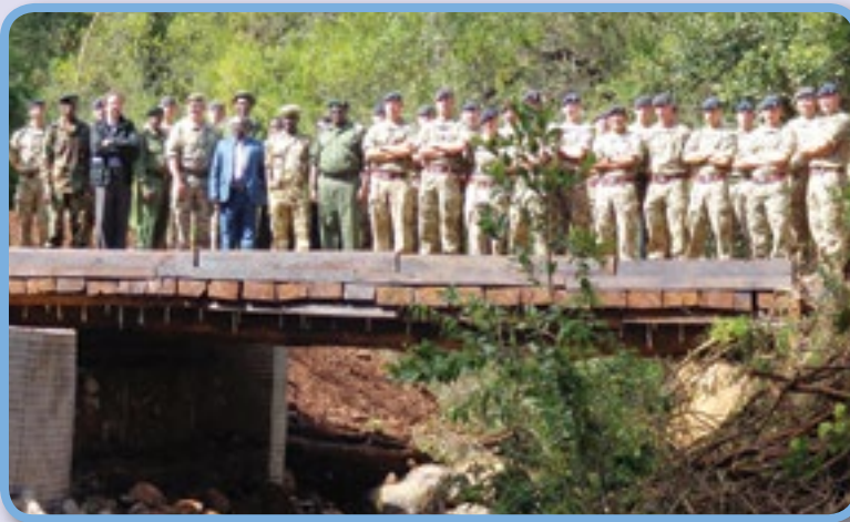
Commissioning of Sirimon Bridge

The rehabilitated Sirimon Bridge was commissioned on 28th November 2014. Present at the commissioning were the Commandant of the British Army Training Unit Kenya (BATUK), the KWS Assistant Director of the Mountain Conservation Area, the KFS Head of Eastern Conservancy, the KWS Senior Warden of Mt. Kenya National Park/Reserve, the KFS Ecosystem Conservator of Meru County and the Executive Director of Rhino Ark, among others.