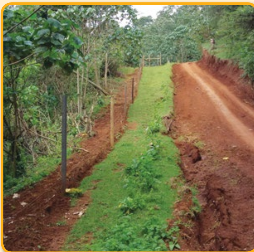
One of the rehabilitated sections of Phase 4

In addition to the Mitero-Wandare section (Phase I) that was entirely rehabilitated last year, sections of Phase 4 have also been rehabilitated this year.