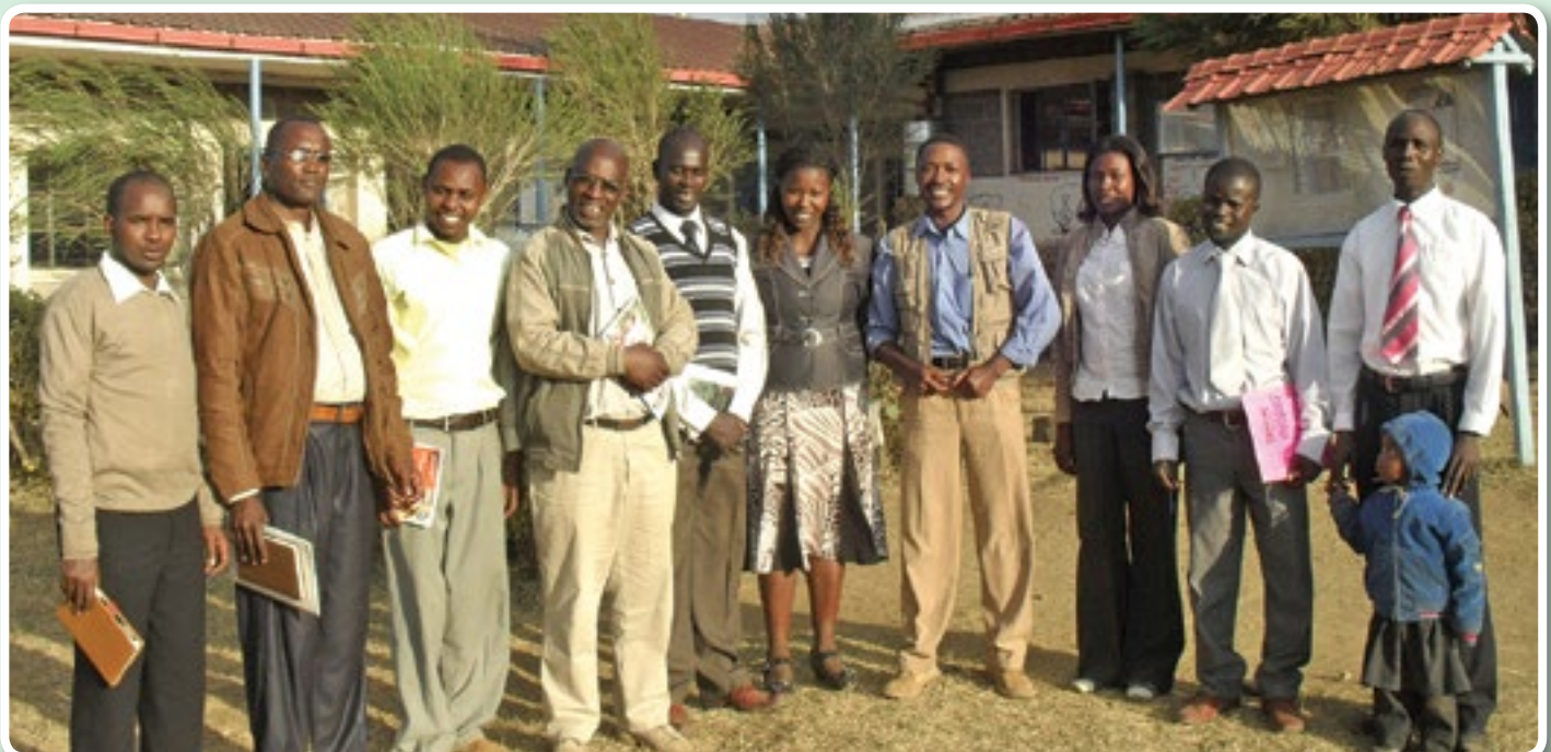
Meeting with school teachers