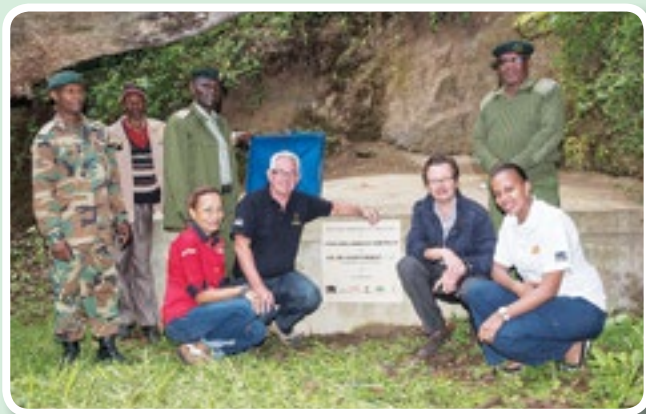
Inspection of spring protection works inside the forest