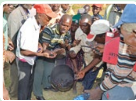
Training at Songoloi