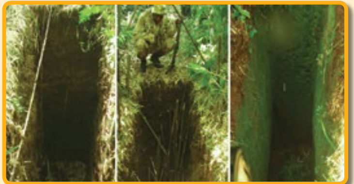
Pit snares found and destroyed during the operation carried out in January 2015

As part of their monthly programme, the recently strengthened Aberdare Joint Surveillance Unit (AJSU) conducted a successful desnaring operation in the Aberdare forest in January 2015. Based on intelligence, AJSU, together with trackers from the Bongo Surveillance Programme and KWS rangers, was sent to the forest within Muranga County to tackle reported snare threats. During the joint operation, five pit snares were found and destroyed (buried). The pits were up to 9 feet deep. Fortunately, no animal signs were seen in the pits.