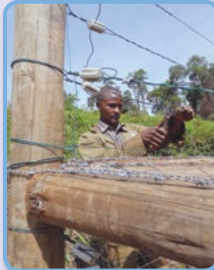
Strainer assembly under construction near Chuka Forest Station