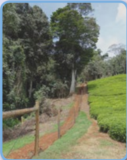
Newly built fence along Chuka Forest

the High Court Judge recognized the benefits of the fence and allowed Rhino Ark and its partners to build the fence along Chuka Forest. Following the ruling, a consultative meeting with key stakeholders and leaders from Chuka was held on 23rd January 2015 at Chuka Forest Station. At the meeting, all participants expressed support to the fence and agreed that, if the land case succeeds, the fence will be moved to the new boundary. Since February, fence construction has started in Chuka Forest.