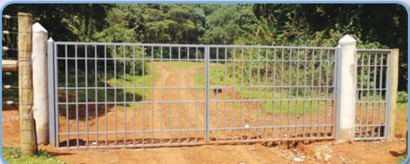
Newly built gate along Mt. Kenya Electric Fence

from Kenya Forest Service and Rhino Ark. The new gates are metal, lockable and mounted on well anchored concrete pillars. They have standard dimensions. To date, all the gates in Kirinyaga County (six vehicle gates and four pedestrian gates) have been built, as well as the seven vehicle gates and three pedestrian gates in Embu County.