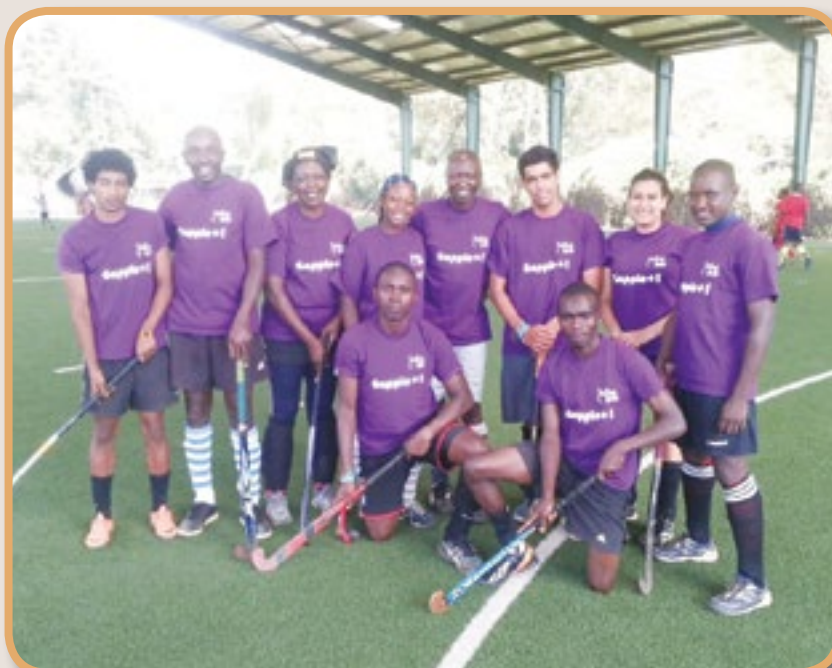
The winning team: Gappies + 1

A total of ten teams participated in the hockey tournament. The day was a resounding success and KES 250,000 was raised. This amount will go towards Car 49's sponsorship pledge for this year's Rhino Charge. The tournament is now established as an annual event and it creates the perfect atmosphere for a fun family day out.