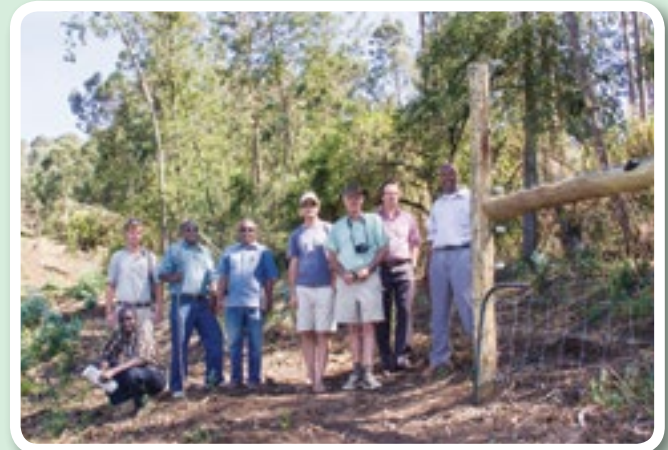
Committee inspects wildlife gate on Loldia Farm/Eburu fence boundary