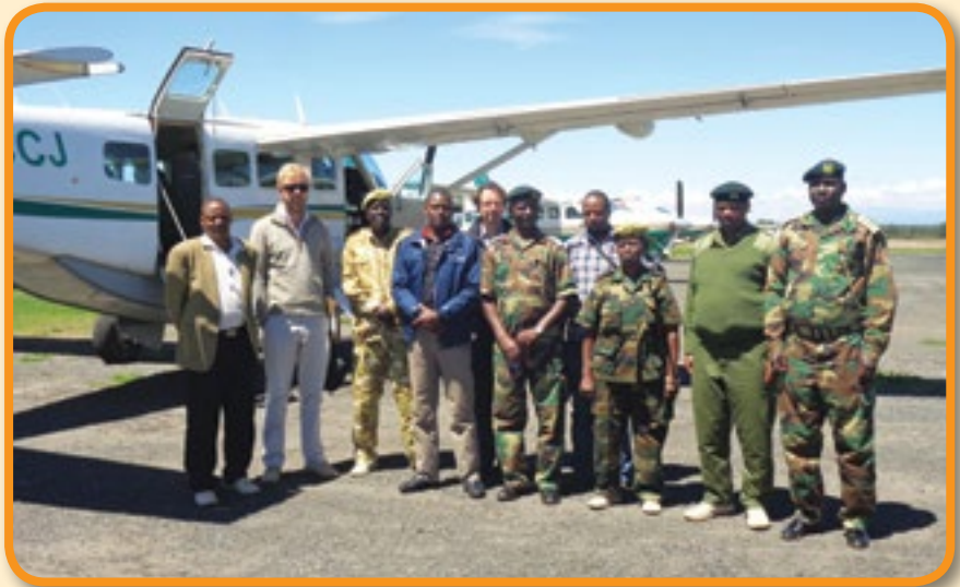
Aerial survey of Aberdares in Nyandarua County on 23rd April 2015

Alternative to cedar posts, such as treated gum posts and plastic posts are available widely on the market, albeit they are more expensive than cedar posts that are most often produced from illegally logged trees. Rhino Ark electric fences are exclusively made using treated gum posts, plastic posts and in the past metal posts.