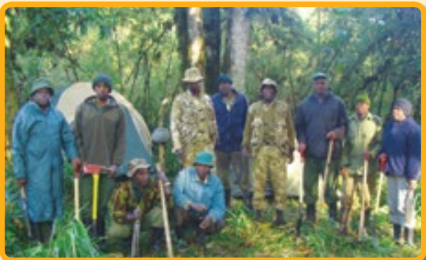
Joint AJSU-BSP-KWS team during the desnaring operation in January 2015