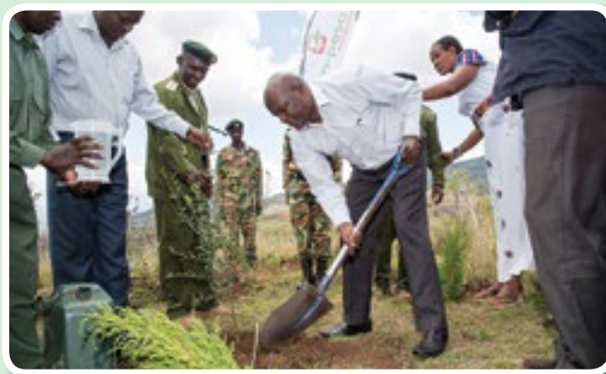
Nakuru County Deputy Governor, Hon. Joseph Ruto plants a tree at Ole Sirwa outpost

The Ole Sirwa community water project was formally commissioned on 14th April 2015 at a colourful ceremony held at the Ole Sirwa cattle trough in Ol Jorai location. The chief guest for the event was Hon. Joseph Ruto, the Deputy Governor of Nakuru County on behalf of the Governor.